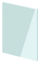
Morning Blue Glass