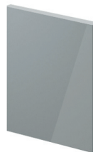
Matte Grey Glass