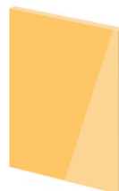
Sunrise Yellow Glass