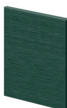
Emerald Green Steel