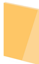
Sunrise Yellow Glass